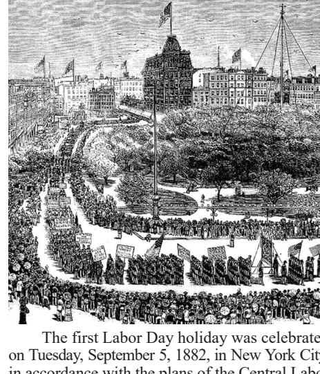
The first Labor Day holiday was celebrated on Tuesday, September 5, 1882, in New York City, in accordance with the plans of the Central Labor Union. The Central Labor Union held its second Labor Day holiday just a year later, on September